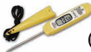
9847N Anti-microbial Instant Read Digital Thermometer

Easy-to-read 0.4" LCD readout. Temperature range -40° to 450°F or -40° to 230°C. Recalibration feature. On/Off switch for long battery life. One second updates. Durable stainless steel stem. Anti-microbial pocket sleeve. LR44 battery installed. Waterproof. NSF listed.