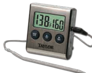
1487 Digital Cooking Thermometer with Probe plus Timer

Program targeted temperature. 48" braided cord with probe. Rubberized buttons. Stainless steel housing. Temperature Range: 32° to 482°F or 0° to 250°C. Times up to 99 minutes, 59 seconds. 1 AAA battery included.