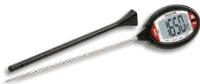
9831-21 Ultra Slim/ Ultra Thin Digital Thermometer

2.5mm stainless steel probe with 1.5mm tip. Helps keep foods juicy and moist. Hold function. Temperature range -40° to 450°F or -40° to 232°C. Storage sleeve. Batteries included.