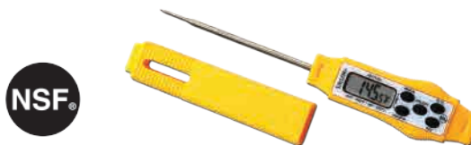
9877FDA Compact Digital Waterproof Thermometer

Pen style LCD readout. Safe-T-Guard™ anti-microbial sleeve inhibits the growth of bacteria. 1.5mm FDA recommended step-down probe tip. On/Off, auto off, hold, min/max memory and recalibration features. °F/°C switchable. Temperature range -40°F to 450°F or -40°C to 232°C. One CR1225 lithium battery included. NSF listed.