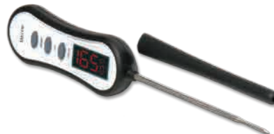
9835 Digital Thermometer with LED Readout

Brilliant LED readout is easy to read from any angle. Stainless steel probe with step down tip helps keep foods moist. Hold function. Temperature range -40F to 450F or -40C to 232C. Storage sleeve. 2 CR2032 lithium batteries included.