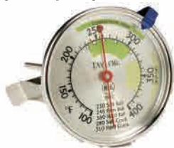
5992N Candy-Deep Fry Thermometer

Temperature range 100° to 600°F. Easy-to-read zone guide references. Hangs or stands. Large, easy-to-read face. Durable stainless steel.