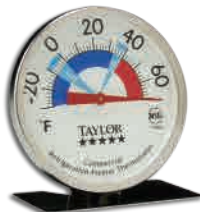
5996N Professional Refrigerator- Freezer Thermometer