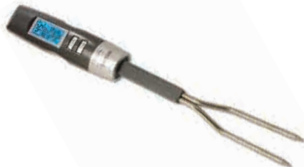
1482N Digital Fork Thermometer

Monitor exact cooking temperatures while cooking. Backlight makes it easy to read in low light. Durable stainless steel tines. Comfort grip handle. Features On/Off, auto off and preset meat/taste levels. °F/°C switchable. Temperature range 14° to 230°F or -5° to 110°C. 2 AAA batteries included.