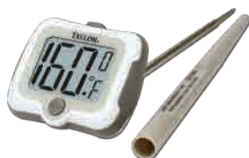
9836 Adjustable Head Digital Thermometer with Oversized LCD

Multiple viewing angles. 1" digital readout. Step-down tip. Auto shut-off. Temperature range -40° to 450°F or -40° to 232°C. Hold feature. 1 LR44 battery included.