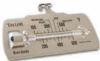
5921N Oven Guide Thermometer

Temperature range 100° to 600°F. Easy-to-read zone guide references. Hangs or stands. Large, easy-to-read face. Durable stainless steel.