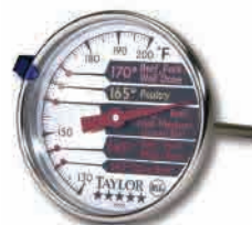
5990N Professional Meat Thermometer

Commercial quality for performance and accuracy. Temperature range 0°F to 220°F. Anti-microbial plastic storage case for safety. Patented recalibration wrench. NSF listed.