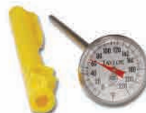
3621N Anti-microbial Professional Chef's Instant Read Thermometer

Large, easy-to-read stainless steel 2 7/8" dial. Temperature range 100° to 400°F. Adjustable pan clip. Durable 6" stainless steel stem. NSF listed.