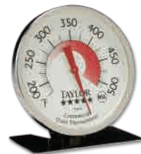
5995N Professional Oven Thermometer

Professional quality and accuracy. Deluxe, easy-to-read stainless steel 2 7/8" dial with preparation scale for various meats. 120° to 210°F temperature range. Durable stainless steel 4 1/2" stem. NSF listed.