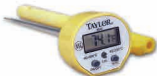
9842 Anti-microbial Instant Read Pocket Thermometer

Oversized 1 3/4" dial. Range 0° to 220°F or -10° to 100°C. Commercial quality for performance and accuracy. Patented recalibration wrench. Anti-microbial pocket sleeve. NSF listed.